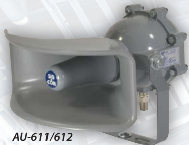
AU-611/612 Explosion Proof Amplified Speaker