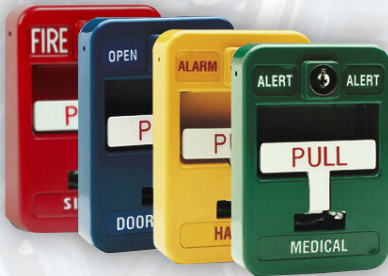
SG-42CXK2 Series Spectrum Color Pull Stations

All Pull Stations Available in Four Colors All Pull Stations Available with Special Labeling