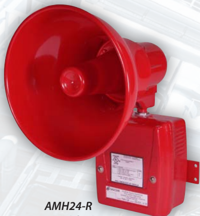
AMH24-R Amplified Speaker for Fire Applications in Hazardous Areas