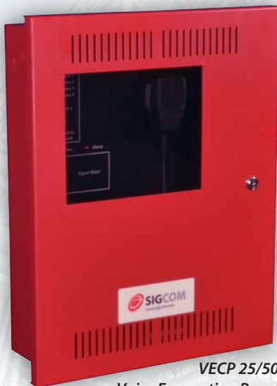
VECP 25/50 Voice Evacuation Panel