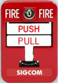
SG-42SK1-SC Pull Station