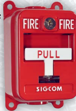
SGX-32SK2-SC Explosion Proof Pull Station