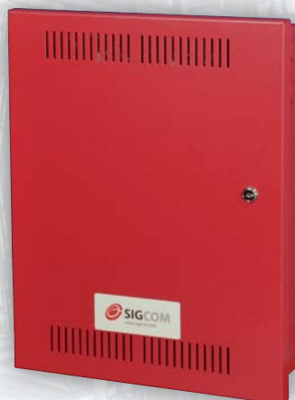
MNS-100 APB 100W Audio Power Booster

Easily expand any voice evacuation system