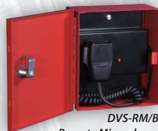
DVS-RM/B Remote Microphone