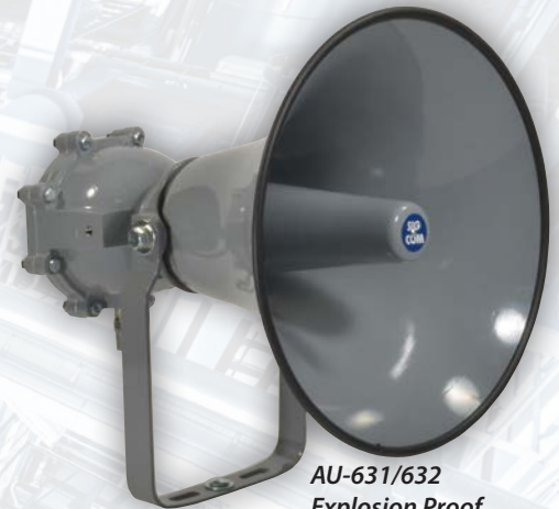
AU-631/632 Explosion Proof Quadra-Tone Amplified Speaker