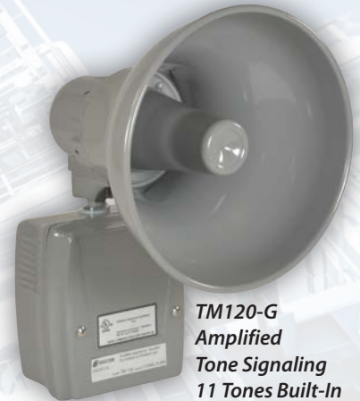
TM120-G Amplified Tone Signaling 11 Tones Built-In